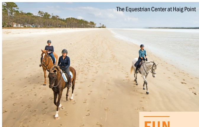
The Equestrian Center at Haig Point